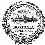
Thomas M. Menino Mayor of Boston

For a copy of the Thrive in Five Executive Summary or Full Report, visit www.thrivein5boston.org .